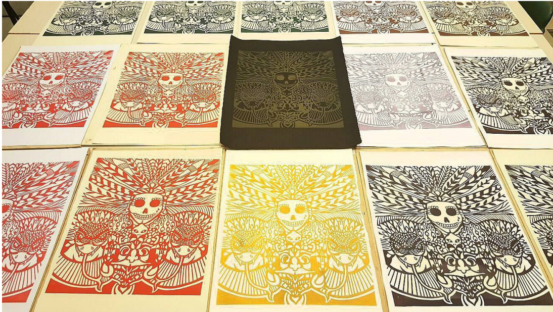
Roberta Feoli," La Reina," Linoleum block printed with Akua Inks