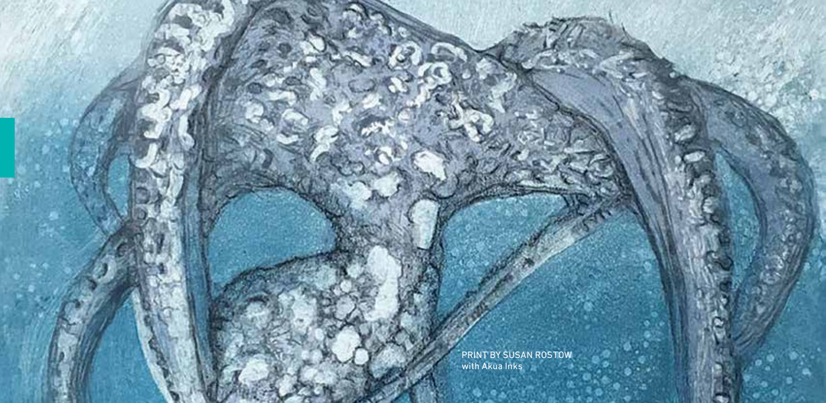
PRINT BY SUSAN ROSTOW with Akua Inks