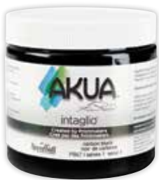
16 FL OZ | 473 ML CARBON BLACK Our top-selling Intaglio color in a larger size! #IICB16