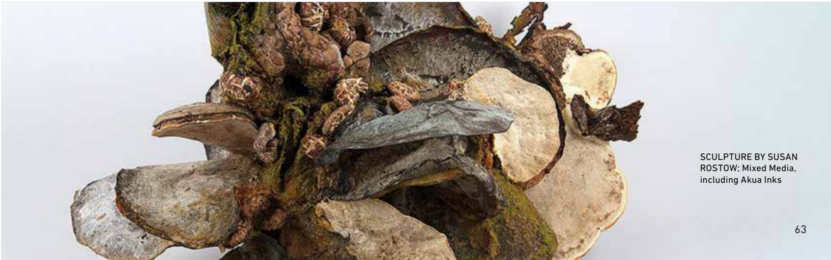
SCULPTURE BY SUSAN ROSTOW; Mixed Media, including Akua Inks

AKUA USER GUIDE Includes a comprehensive introduction to the entire Akua line. Highlights the key features, benefits and working properties and also provides artists with tips and tricks for incorporating the inks, modifiers, tools and accessories into their works of art. An ideal reference guide for any printmaker! #82P005