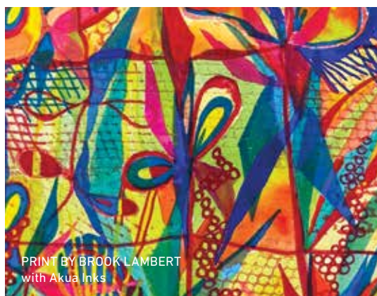
PRINT BY BROOK LAMBERT with Akua Inks