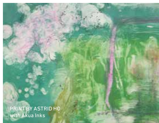
PRINT BY ASTRID HO with Akua Inks