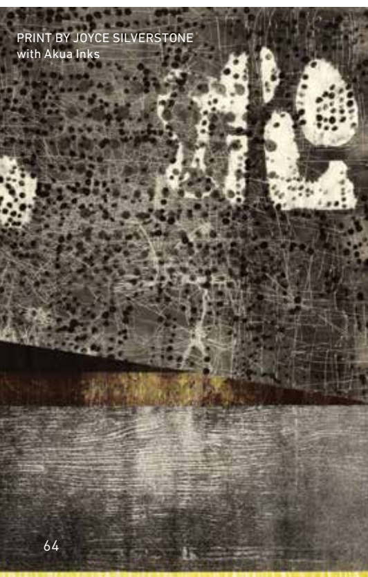
PRINT BY JOYCE SILVERSTONE with Akua Inks