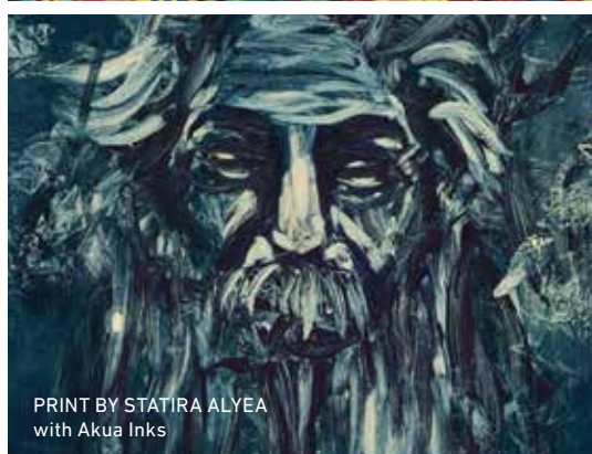
PRINT BY STATIRA ALVEA with Akua Inks