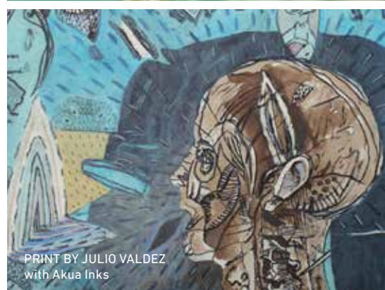
PRINT BY JULIO VALDEZ with Akua Inks